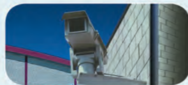
Web Based Video