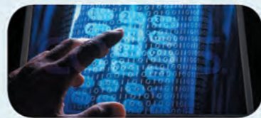
High Security Communications